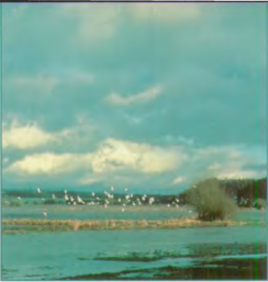
The Somerset Levels and Moors.

To ensure close contact is kept with local communities the South West Region is split into four areas - each with its own Area Manager and staff. Teams work on the ground using local knowledge and contacts to maximum effect.