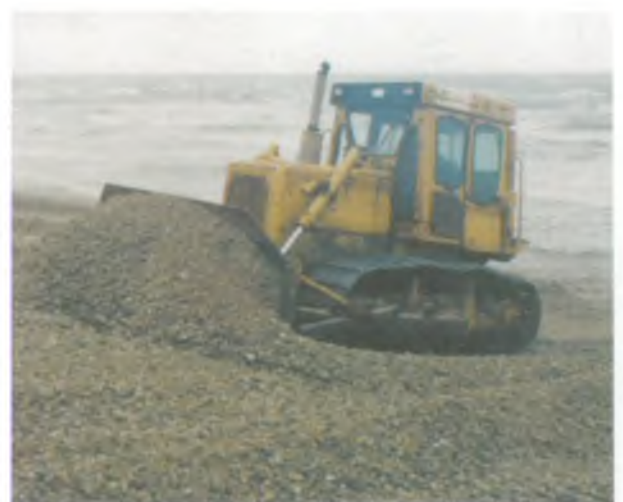
Maintaining existing defences in the short term