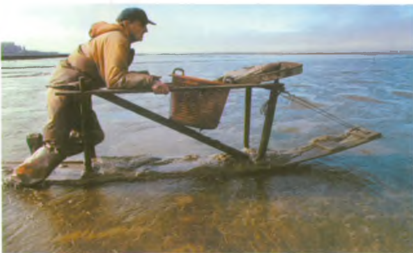
Fisherman using a traditional 'mud horse' on Steart mudflats