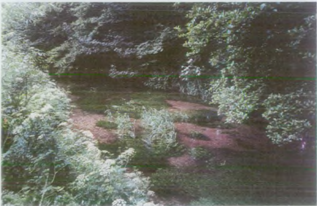
Figure 3.1 b) R. Lambourn at Bagnor (shaded side). June 1999. View downstream from near the top of the site showing carpet of Berula .