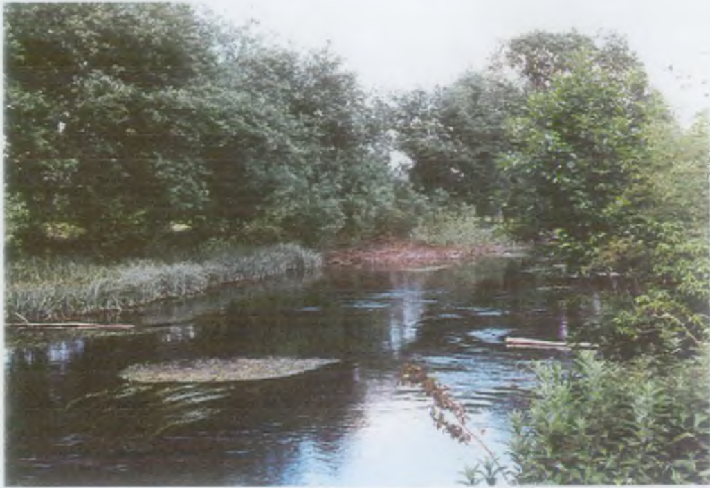
Figure 3.3 c) R. Kennet at Savernake (upper). June 1999. Downstream view of the site from upper site limit.