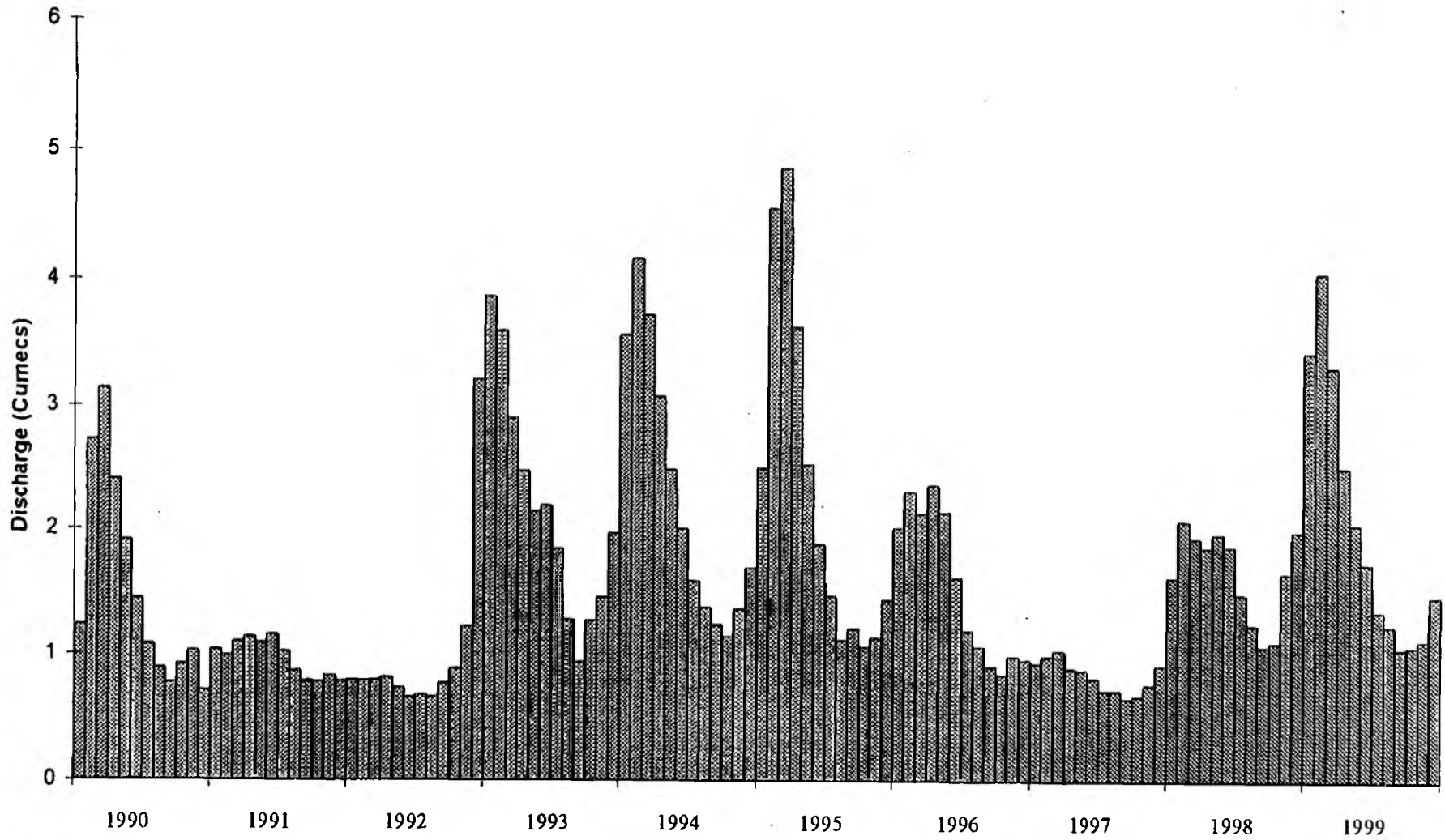
Figure 2.1. Monthly mean discharge on the R. Lambourn at Shaw, January 1990 – December 1999