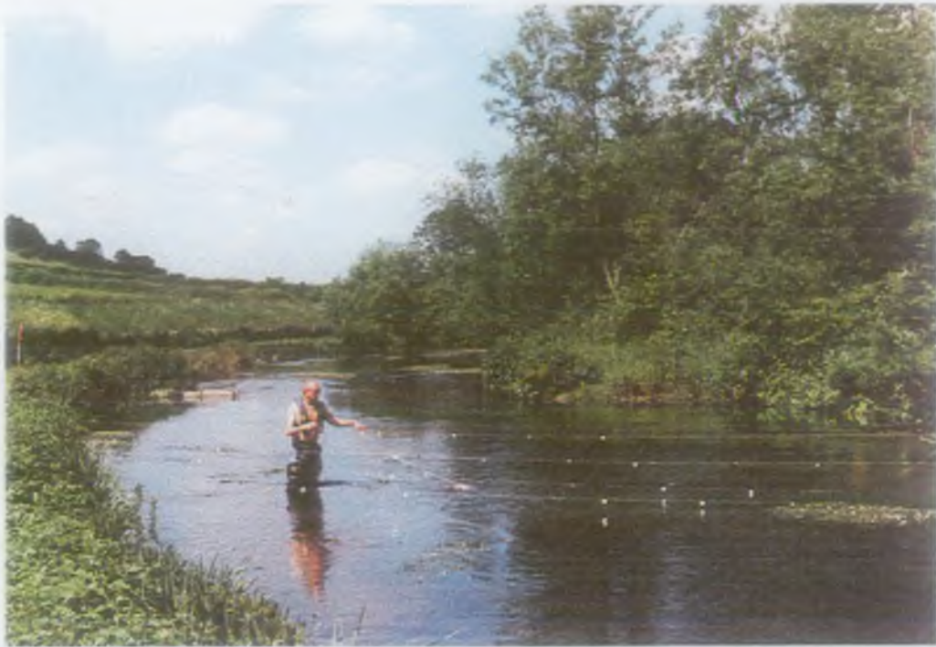
Figure 3.3 a) R. Kennet at Savernake (lower). June 1999. View upstream.