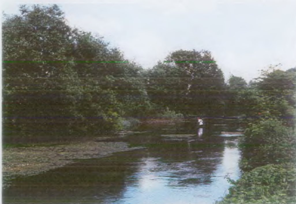
Figure 3.3 d) R. Kennet at Savernake (upper). June 1999. Downstream view of the site from further upstream.