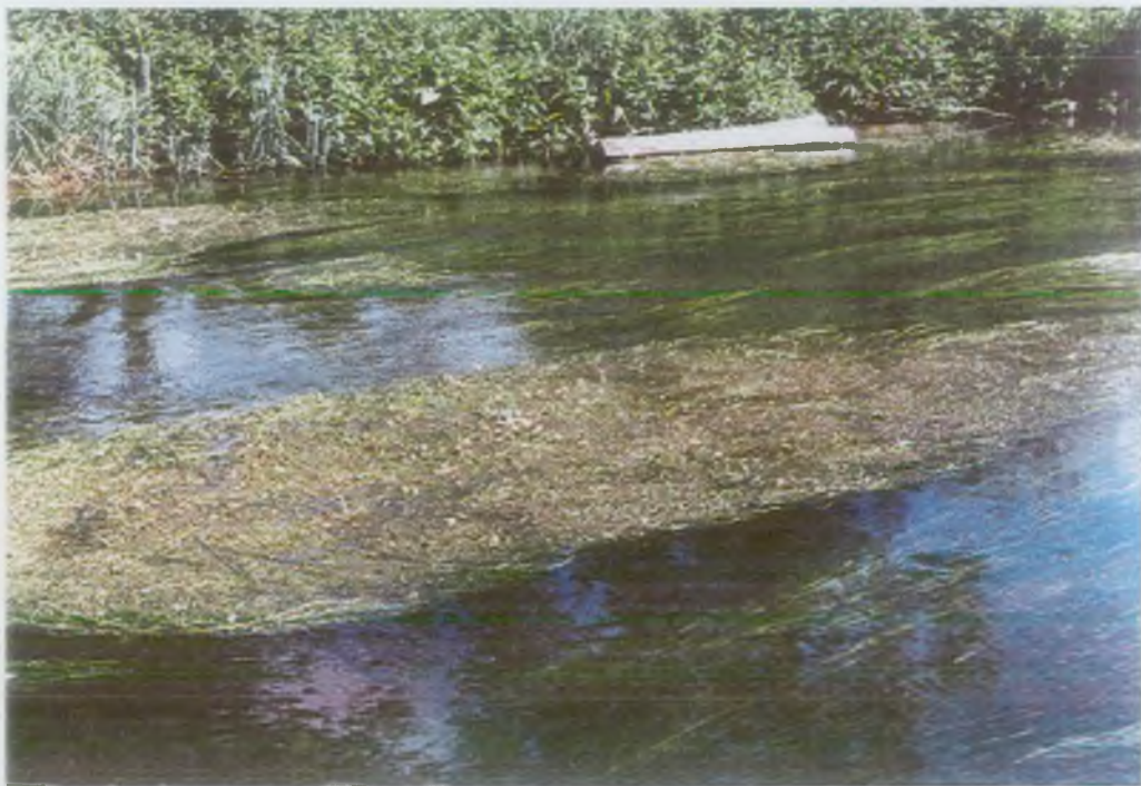
Figure 3.3 b) R. Kennet at Savernake (lower). June 1999. Surface Ramunculus bed with accumulated debris.