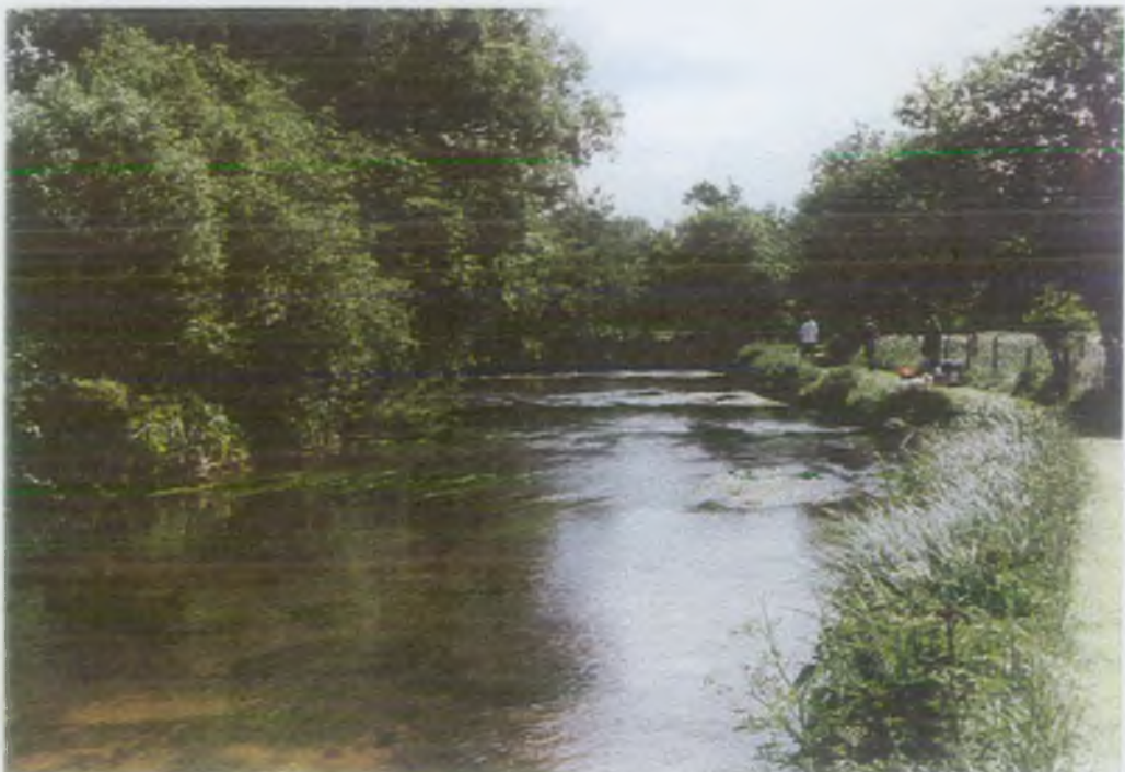
Figure 3.2 b) R. Kennet at Littlecote. June 1999. View downstream from the middle of the 100m site.