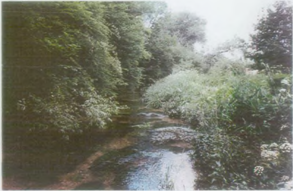
Figure 3.1 a) R. Lambourn at Bagnor (shaded site). June 1999. View upstream from the bottom of the site showing beds of Ranunculus .