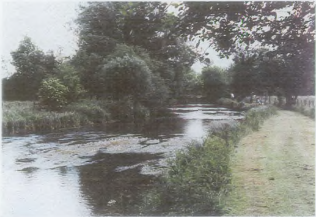
Figure 3.2 a) R. Kennet at Littlecote. June 1999. View downstream from the top of the 100m site.