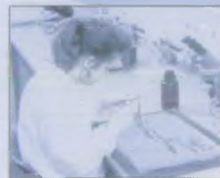
Carrying out a post mortem

Further copies of this document are obtainable from your local region