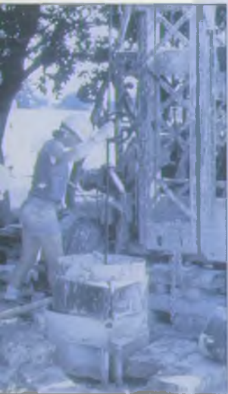
Bore hole drilling